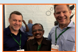
(Chennai, India) This man leads 130 groups that speak 80 different languages. He loves TTB and listens to TTB-Tamil every day. He wants to work to get TTB into as many of these 80 languages as possible!

One of the leaders of a Christian denomination said that until they studied the book of Luke with TTB, they didn't know Jesus was God. When the Radio Home Group concept was introduced to him, a local pastor said, "I have been praying for something like this for 16 years! Now our people can learn the Word of God systematically."