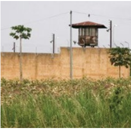
Outside the prison in Ivory Coast.