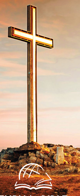
FULLY GOD. FULLY MAN. LORD OF ALL.